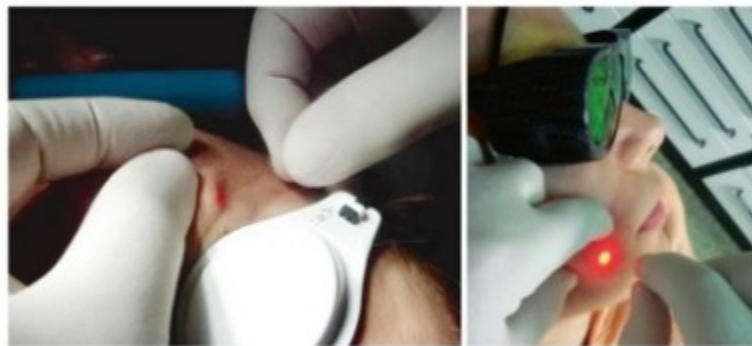
Fig. 28.8 Endo Light Lift™ laser Eufoton 808–904 nm, 5.8 W, and 5 shots at 40/50 ms

The regenerative process of the Biodermogenesis™ is determined with the production of collagen and elastic fibers in order to permit a stability of the obtained result (Fig. 28.9). The elastic collagen starts to take its